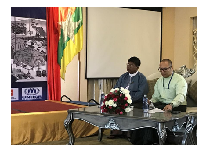
Figure 2: RRD and IOM preparing for the ToT opening

He encouraged participants to take advantage of the training and to take a step back from their daily activities in the camps in order to gain in depth technical knowledge of CCCM and to acquire the skills to become a trainer, further contributing to raising the living conditions of IDPs across the country.