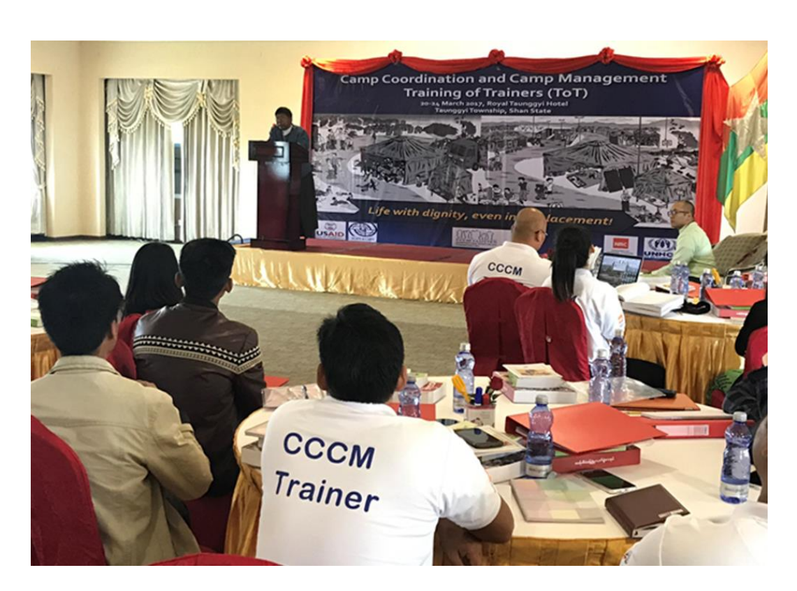
Figure 4: RRD State Director addresses opening speech to ToT participants