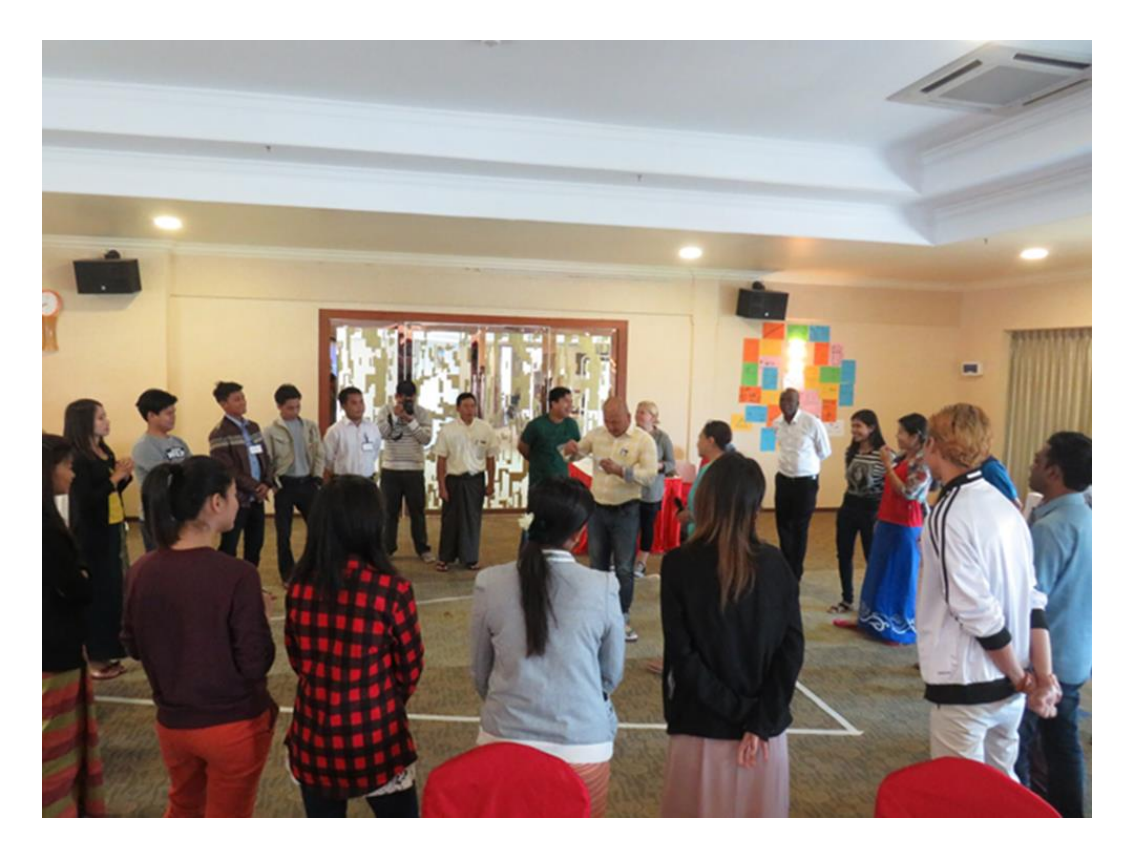
Figure 9: Group activity designed to show that CCCM facilitators are at the time facilitators, instructors and learners