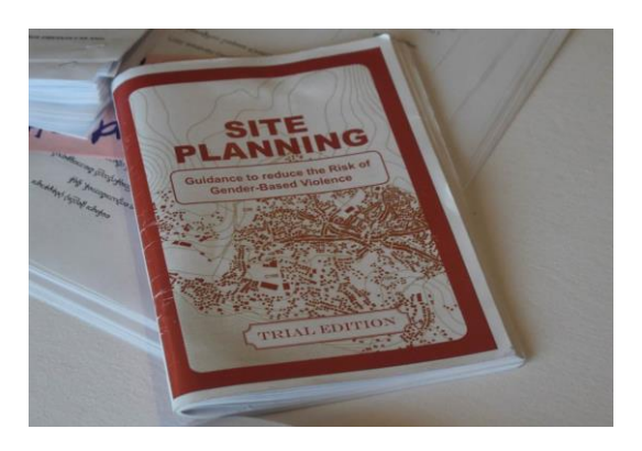
Figure 8: Site planning guide to prevent SGBV