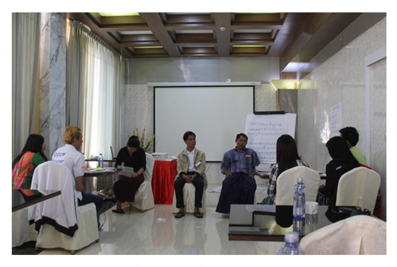
Figure 13: Peer to peer constructive feedback on one of the participant-led sessions