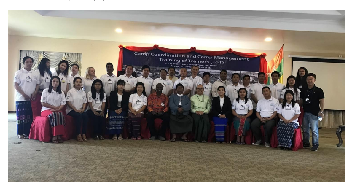
Figure 1: Family picture of the 2017 ToT participants with the RRD State Director

This document is the report of the TOT held in Taunggyi, Shan State, from the 20 to the 24 of March 2017, jointly organized by IOM and NRC in their respective roles as CCCM technical service providers to the cluster. During the five-day training, participants were introduced to CCCM tools, adult learning methods, training /coaching techniques, minimum standards and best practices in camp management. By promoting the understanding of the roles and responsibilities in CCCM, of community participation, and of the camp management activities during the different phases of the camp life cycle, CCCM can significantly contribute to accountable provision of assistance and protection to the displaced population.