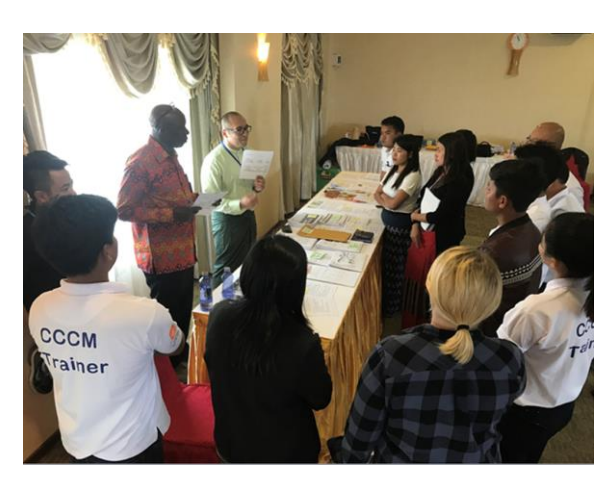
Figure 6: Marketplace