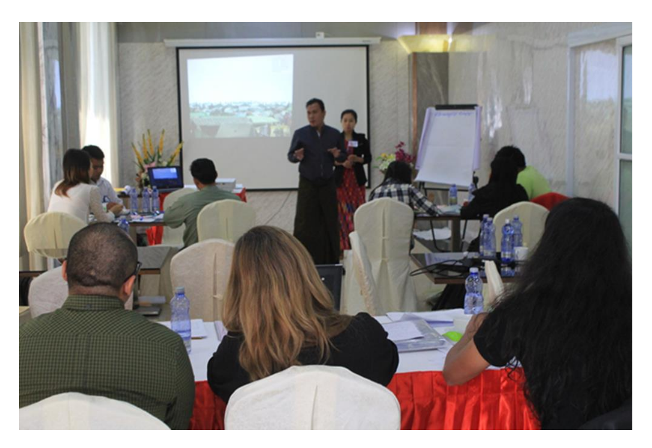
Figure 12: Participant-led session on Coordination and Information Management