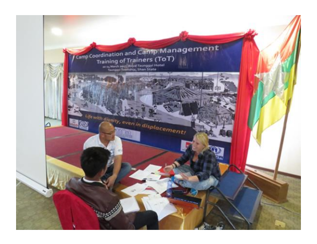
Figure 10: Group work to prepare the session on Protection

This session was devoted to participant's work on their respective topics. This session was not planned in the 2016 ToT Training and facilitators who attended both events felt that providing more time to participants was necessary for them to prepare a quality session while enjoying the overall ToT experience. Hence, participants worked on the training materials while facilitators made themselves available to assist with questions and guidance.