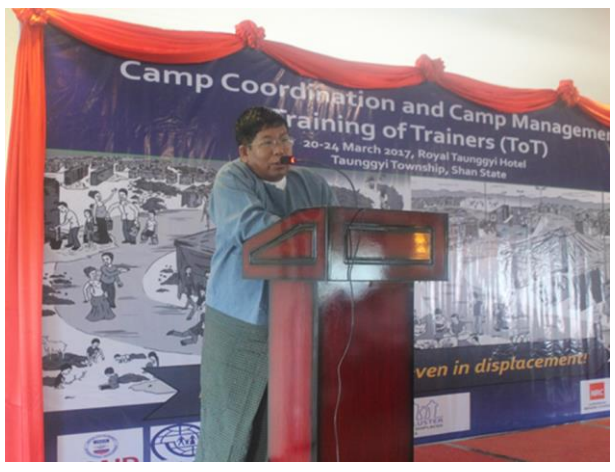
Figure 3: State Director of Relief and Resettlement Department of Shan State