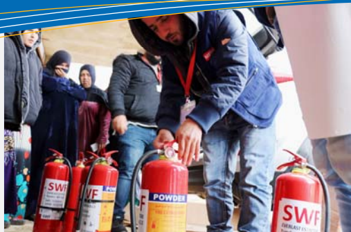
Distributing fire extinguishers in the Bekaa.