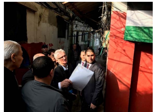
USG Lowcock touring Burj al-Barajneh camp after his meeting with refugees.

The situation in Burj al-Barajneh refugee camp, south of Beirut, reflects the severe challenges of daily life in Palestine camps across Lebanon where high numbers of Syrian (47.9 per cent of the total population inside the camp), Palestinian Syrian refugees (3.7 per cent) and Palestine refugees (44.8 per cent) endure extremely difficult living conditions. Meeting the refugees and listening to their stories was an opportunity for the USG to understand some of the major issues refugees deal with on a daily basis.