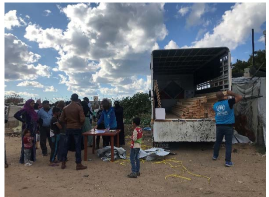
UNHCR staff unload building materials at an informal settlement in southern Lebanon.

The winter season is a double challenge for vulnerable families, as they have to deal with very difficult conditions in many of the basic dwellings, informal settlements or collective shelters live in, while having fewer opportunities for casual income to support their families because of the lack of agricultural activity in winter.